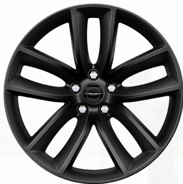
WHF - 20-Inch Low Gloss Black Noise Alloy Wheels (Standard on 300 SRT Core & 300 SRT)