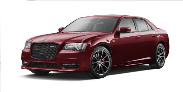
PRV - Velvet Red (Option)