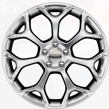
WDE - 20-Inch Alloy Wheels (Standard on 300C Luxury)

Option (O) Standard (S) Not Available (-) Must Have (m/h) Not Available With (NAW)