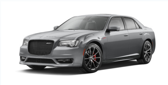
PSE - Silver Mist (Option)