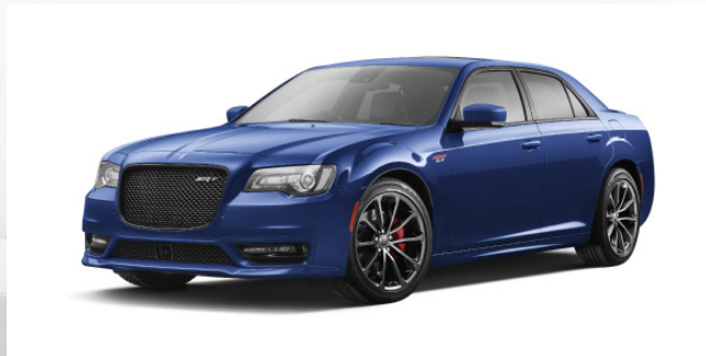
PBM - Ocean Blue (Customer Order Only)