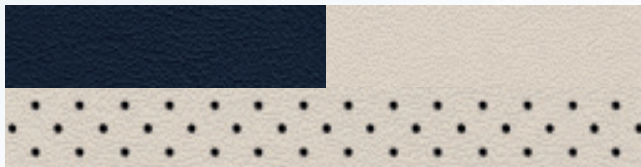
ELC3 - Indigo & Linen Quilted and Perforated Nappa Leather (Option on 300C Luxury)