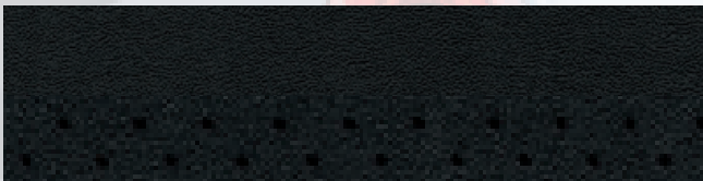
T5X9 - Black Perforated Nappa Leather and Suede (Standard on 300 SRT)