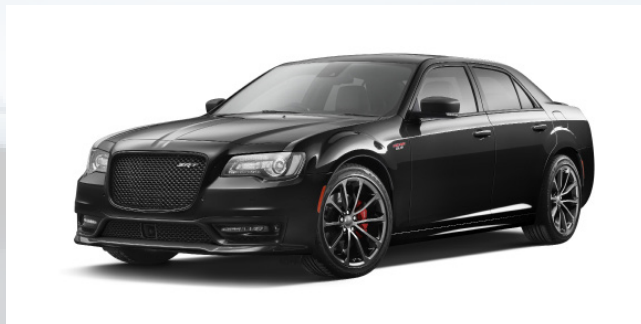
PX8 - Gloss Black (Standard)