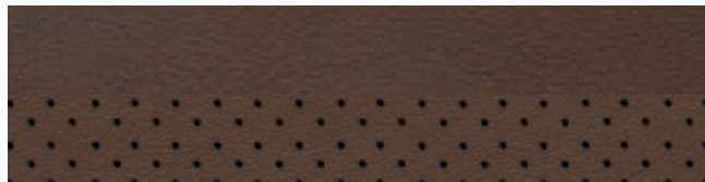
ELX8 - Deep Mocha Quilted and Perforated Nappa Leather (Option on 300C Luxury)